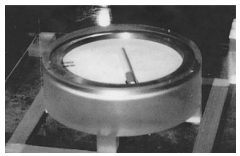
FIG. 2 Close-up of Test Cigarette, Filter Paper Holder, Metal Pins and Metal Rim

chamber's side wall and the latching device secures the door tightly. All construction seams shall be inspected to ensure they are airtight and no cracks shall be visible on any surface of the test chamber. If leaks are detected, measures shall be taken to ensure that these areas are again made sufficiently air tight.