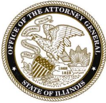
STATE OF ILLINOIS KWAME RAOUL ATTORNEY GENERAL