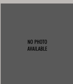
Olufemi "Femi" OGUNDELE